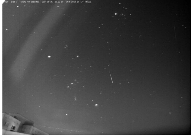
Figure 2 - Image from the QHY5-LII Mono camera with Tamron 3-8mm f/1.0 megapixel lens. A meteor is visible in the middle part of the image. Clear weather and a moonless night with significant light pollution.

PointGrey BlackFly 0.9 became the first megapixel camera of the PFN and works continuously at the PFN55 Ursynow station with designation MDC01 (Meteor Digital Camera 1).