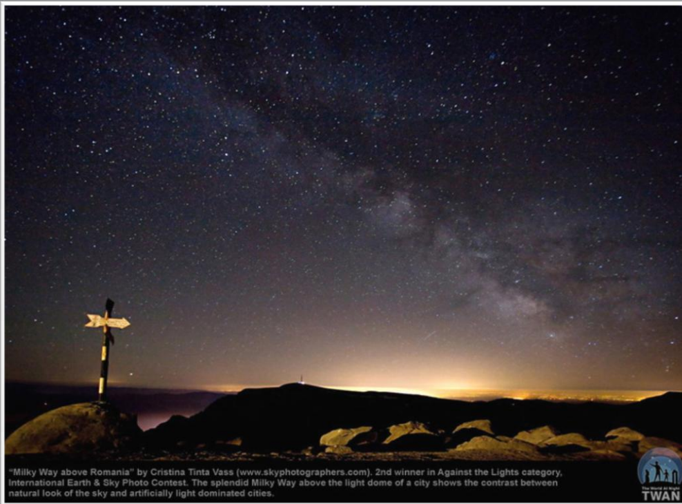
"Milky Way above Romania" by Cristina Tinta Vass ( www.skyphotographers.com ). 2nd winner in Against the Lights category, International Earth & Sky Photo Contest. The splendid Milky Way above the light dome of a city shows the contrast between natural look of the sky and artificially light dominated cities.

Two SARM members became also Winners among the 10 Winners of the IYA Earth and Sky astrophotography contest.