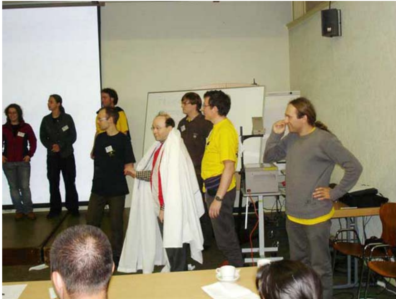
IMC 2006 RODEN