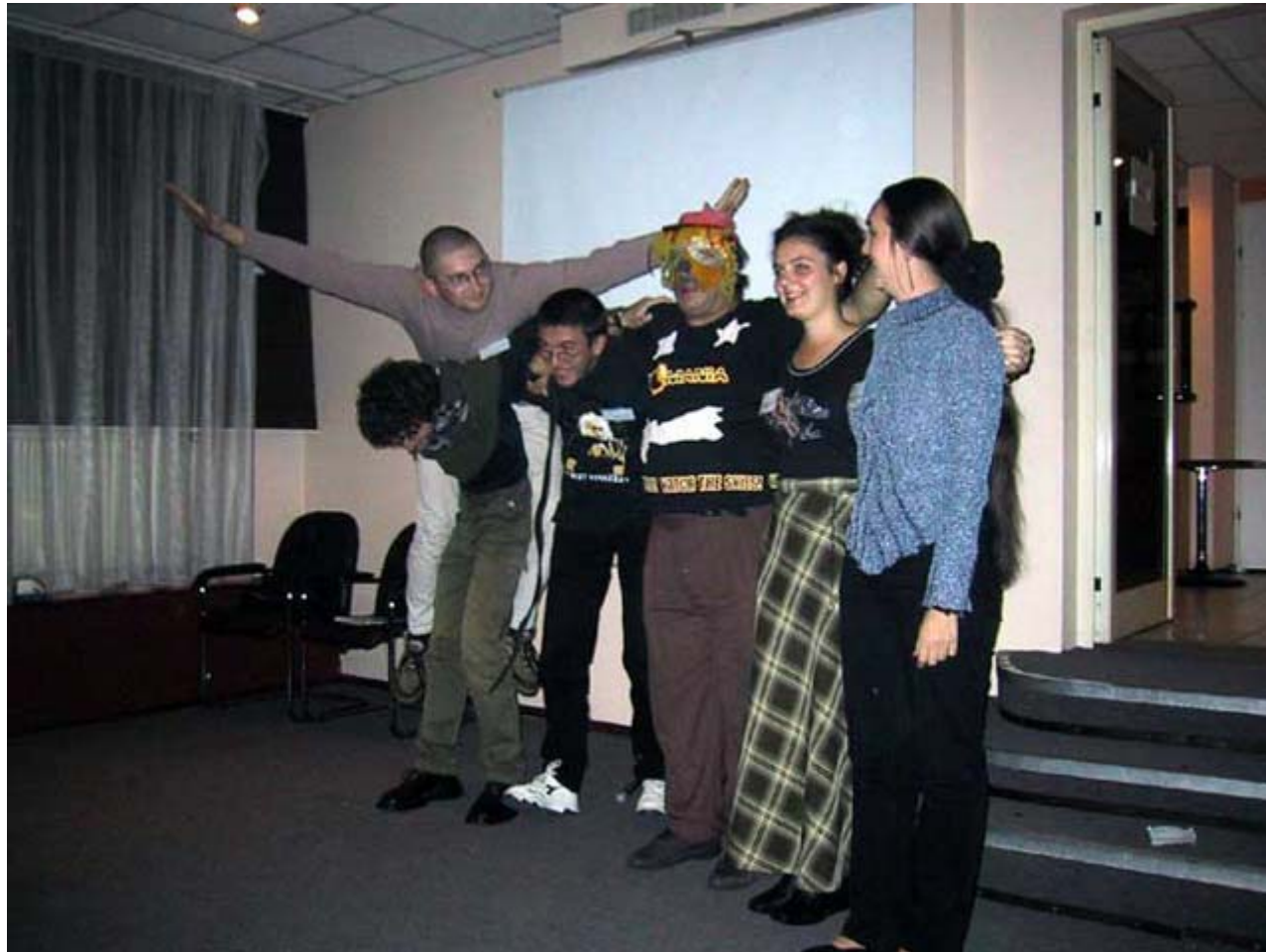
IMC 2003 BOLLMANNSRUH