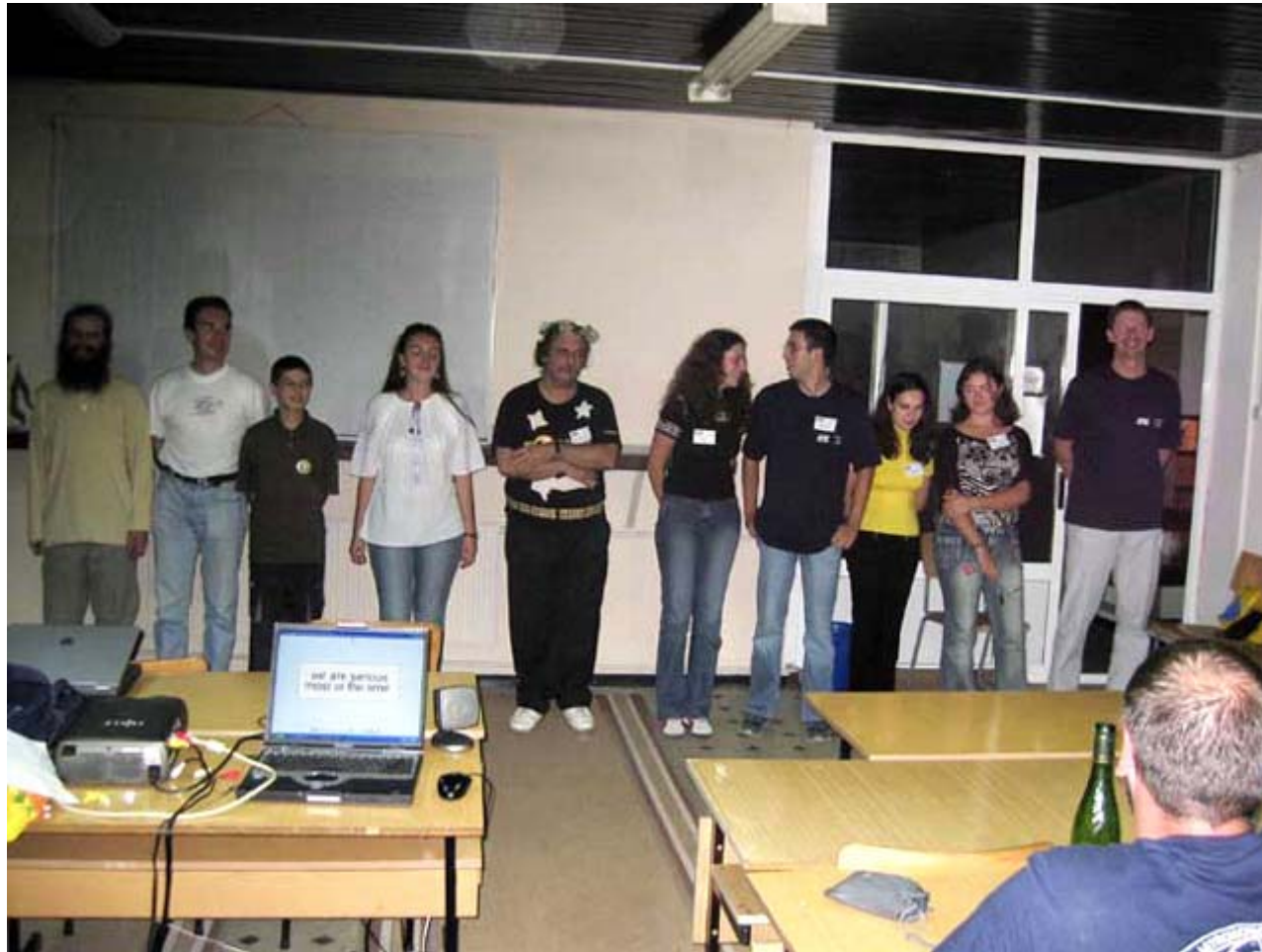
IMC 2005 OOSTMALLE