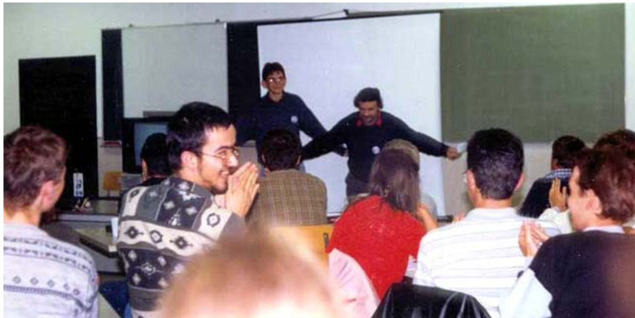
IMC 1998 STARA LESNA