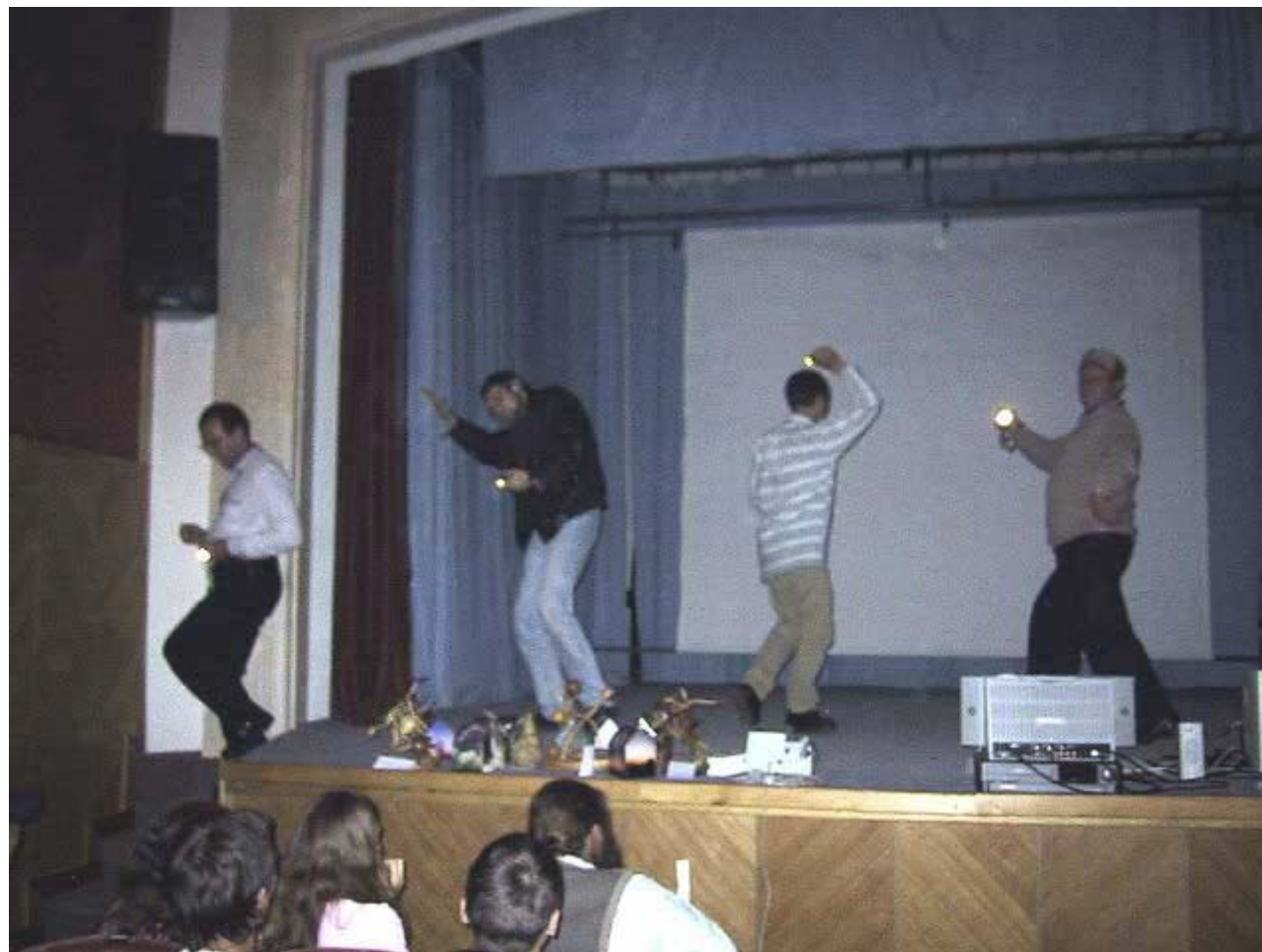
IMC 2001 CERKNO